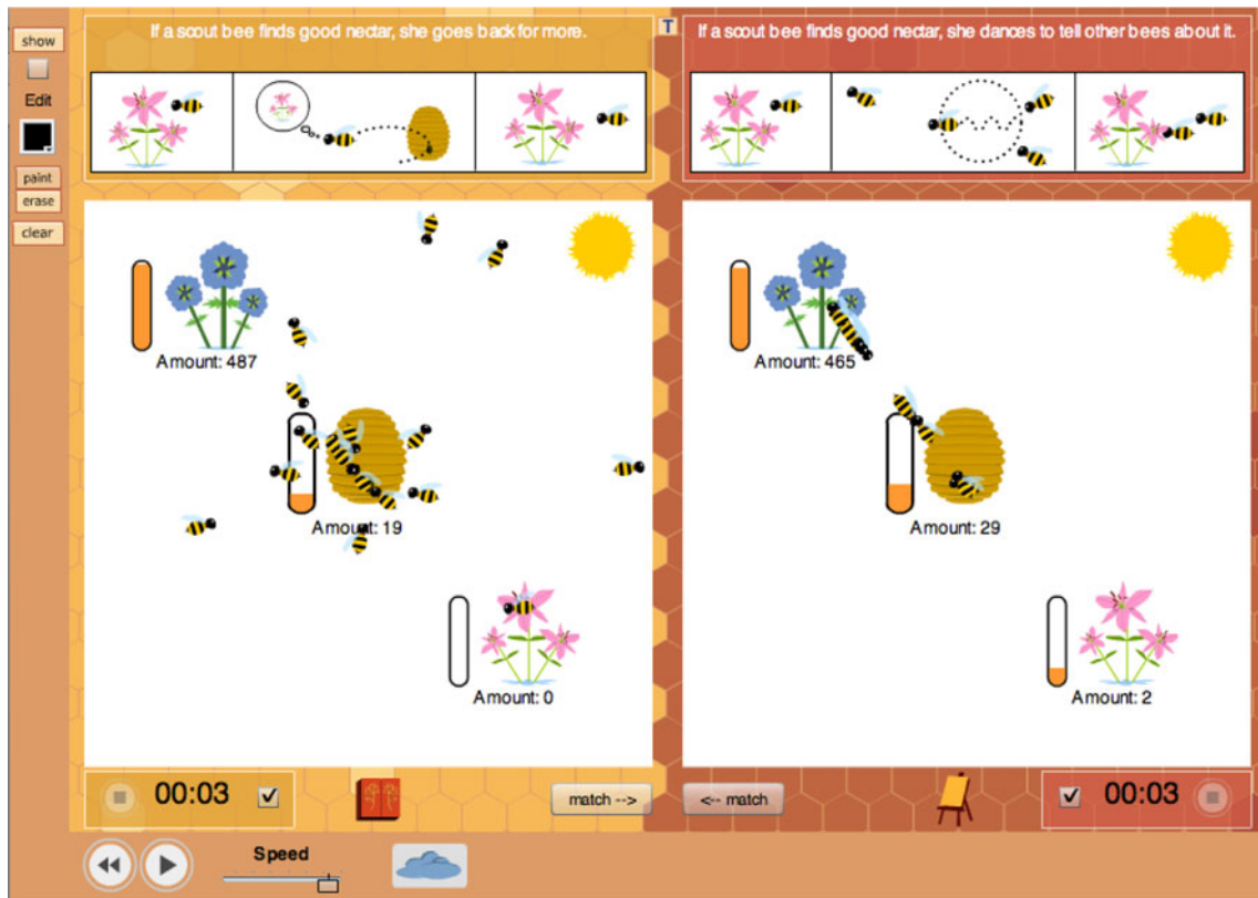
Fig. 2 The BeeSign Interface depicting the difference in bee flight patterns between a hive where the bees are dancing ( right ) and a hive where the bees simply remember the location of a flower ( left )