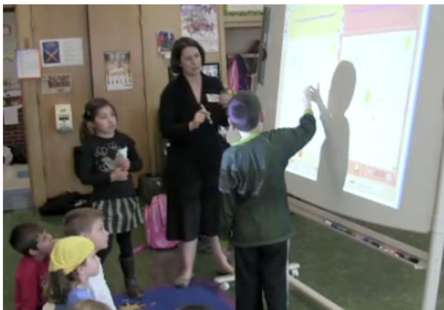
Fig. 3 A student explains their prediction in BeeSign

relationship with the community is captured in the rules and division of labor.